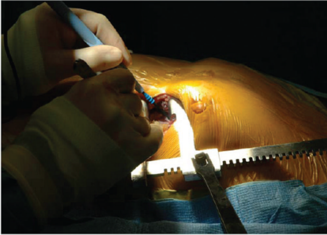
Distal anastomoses via small thoracotomy