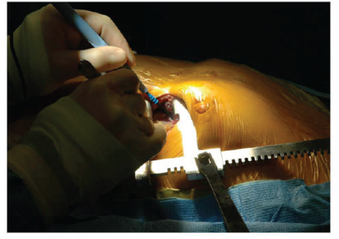
Distal anastomoses via small thoracotomy